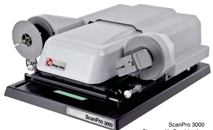
ScanPro 3000 Shown with Combination Fiche, and Motorized 16/35mm Film Carrier